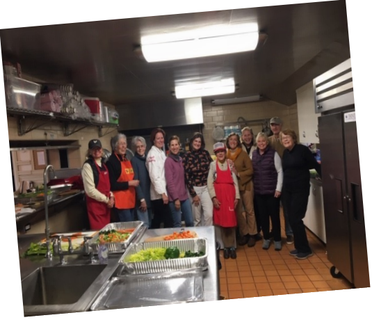
Thank you for your support.

God bless all of you that witness our efforts. We feel we are making an impact and welcome your suggestions for improvement as we consider future endeavors. We are a transparent function of Trinity Church and invite you to examine our utility and personally join us in the kitchen or to the District. Having served over 2000 people in 2019 at a cost of just under $3.00 a person, we stand by our achievement.